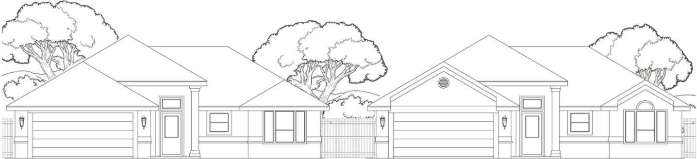
A - BRICK