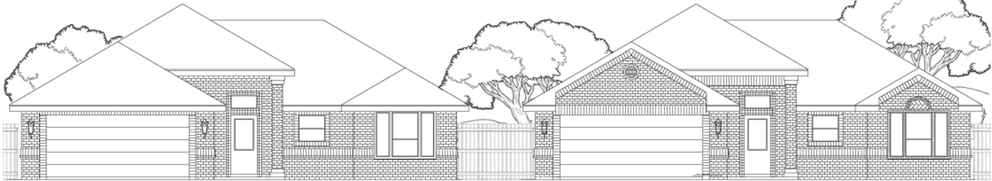
B - BRICK