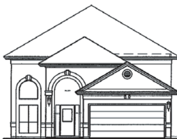
A - STUCCO