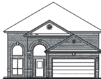
B - BRICK