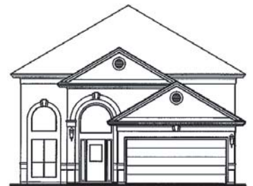
B - STUCCO