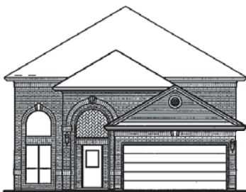
A - BRICK