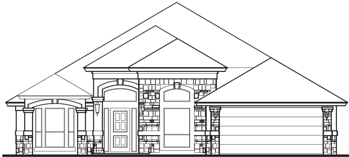
A Stucco/ Stone option