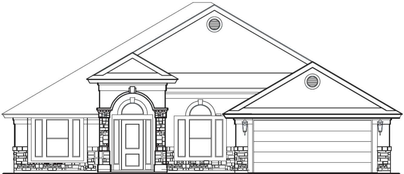
B Stucco/ Stone option