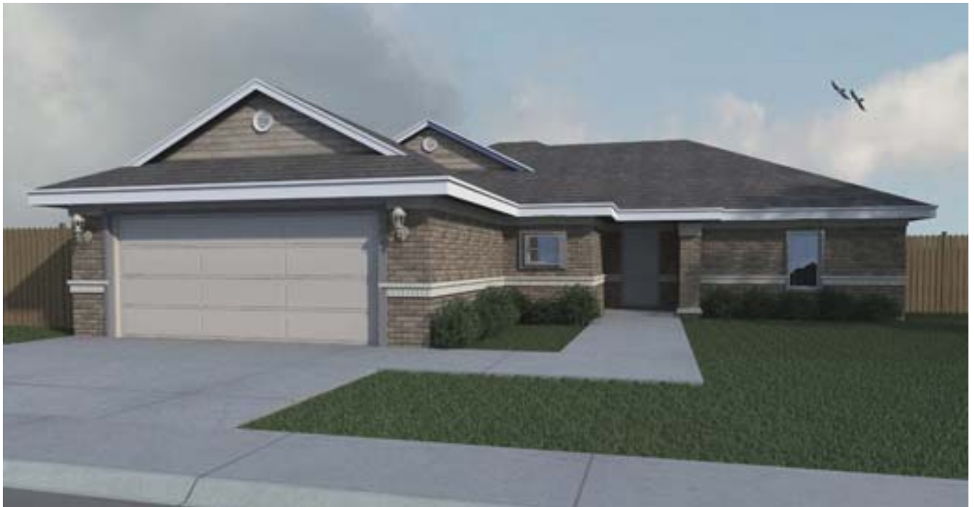
A - BRICK