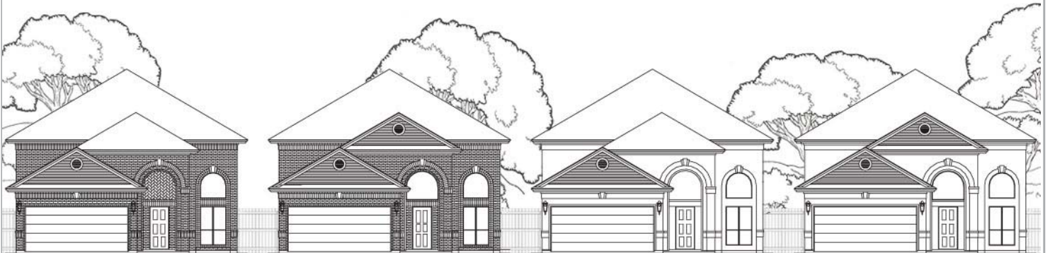
A - BRICK