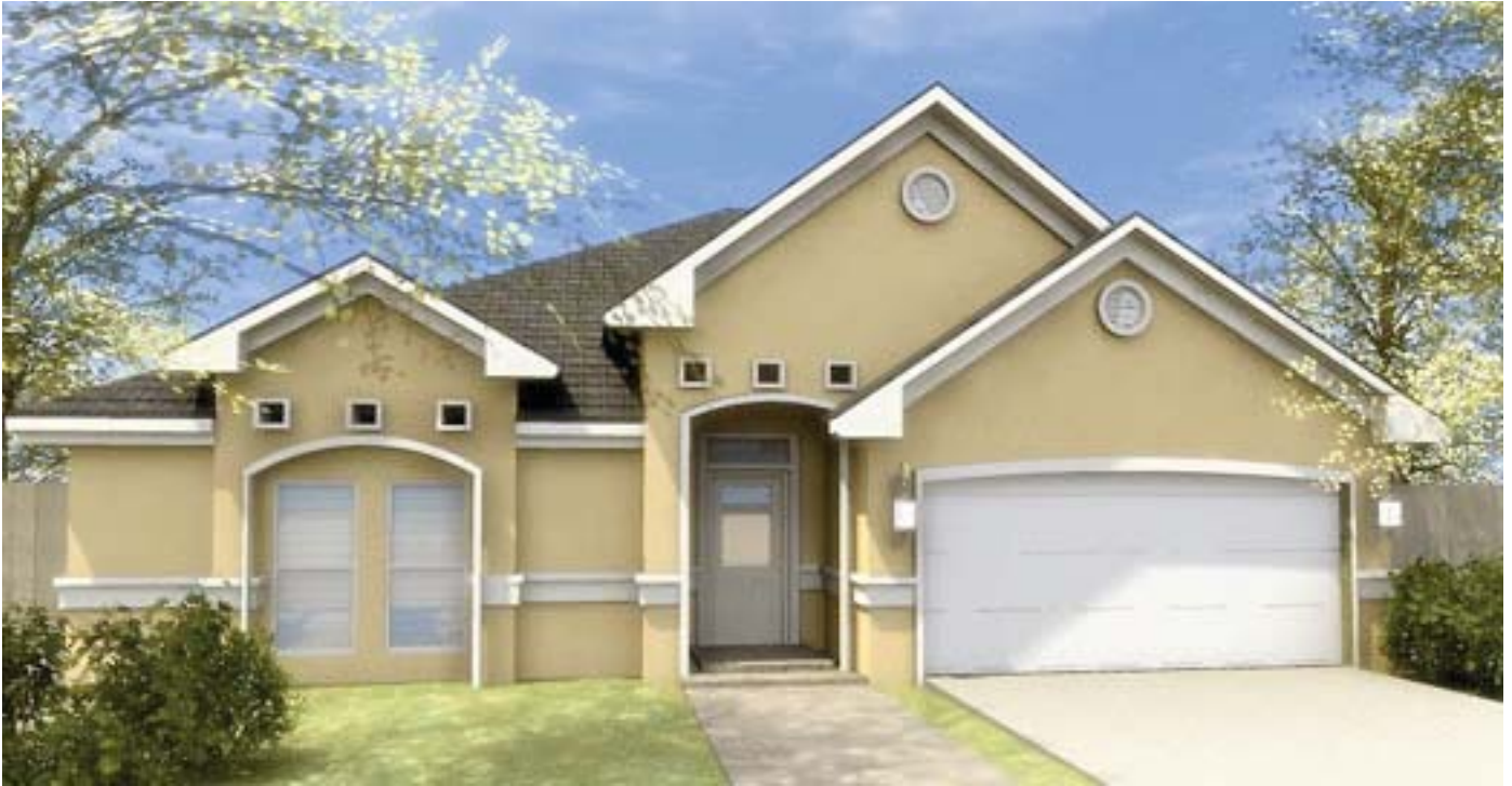
A - Stucco