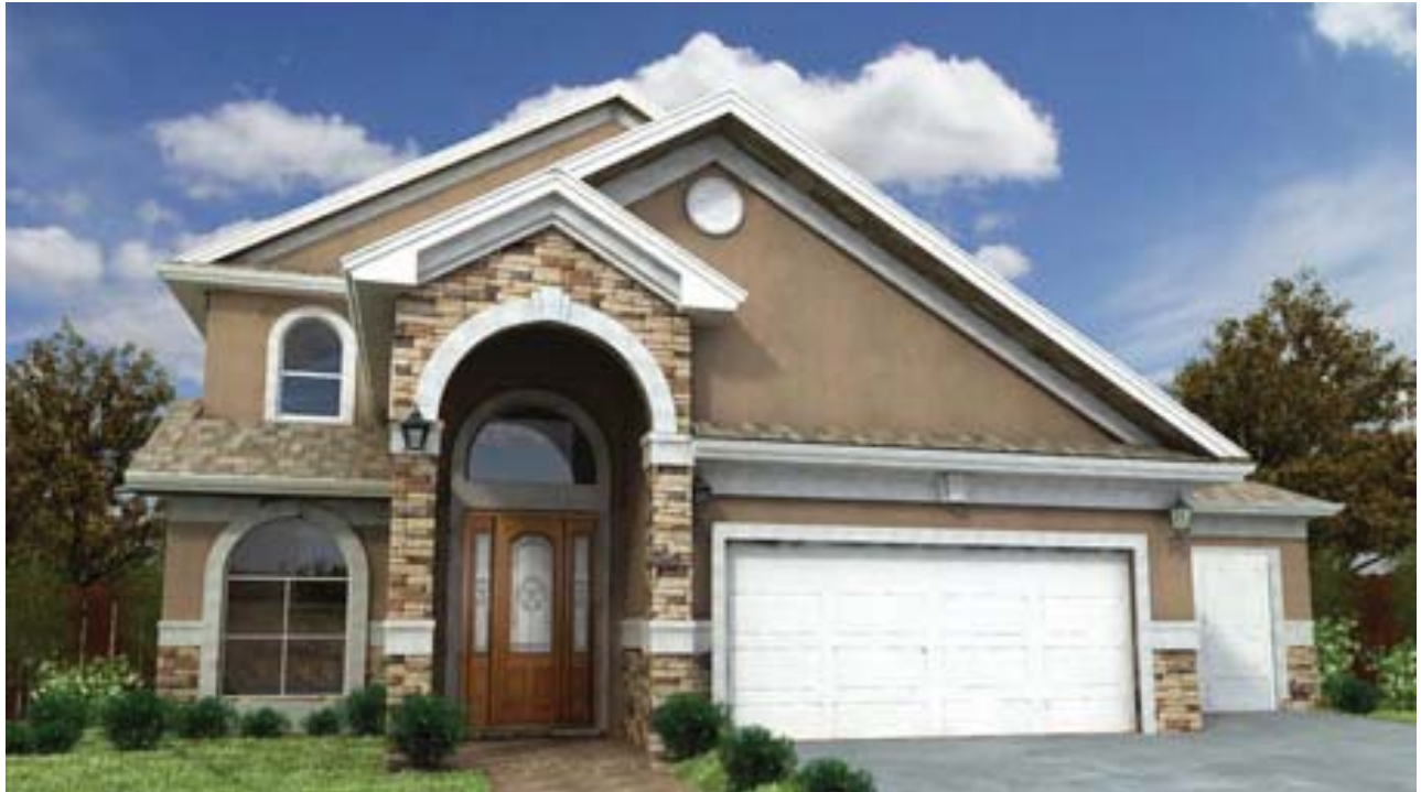
A - BRICK