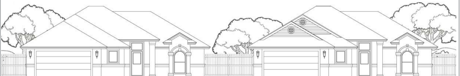
B - STUCCO