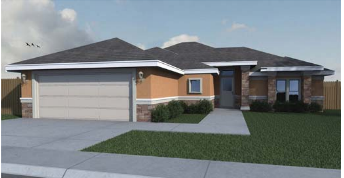
A - BRICK