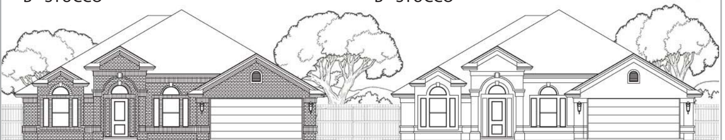
B - STUCCO