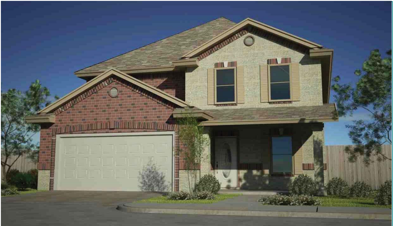
A - BRICK